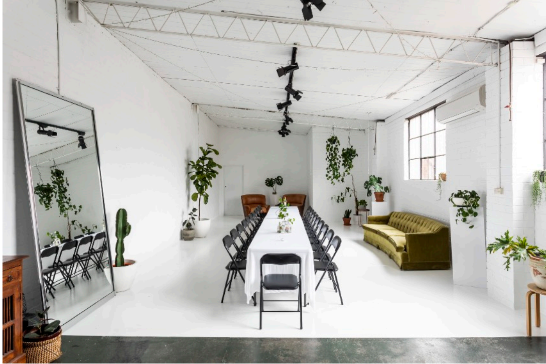
Sit-Down Furniture Hire Package