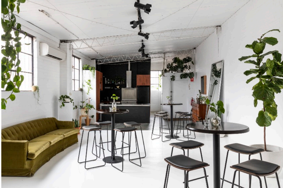
Cocktail Furniture Hire Package